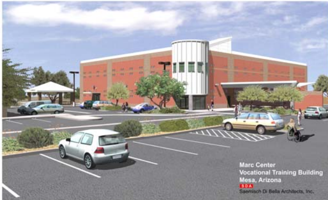
Rendering of the Marc Center Vocational Training